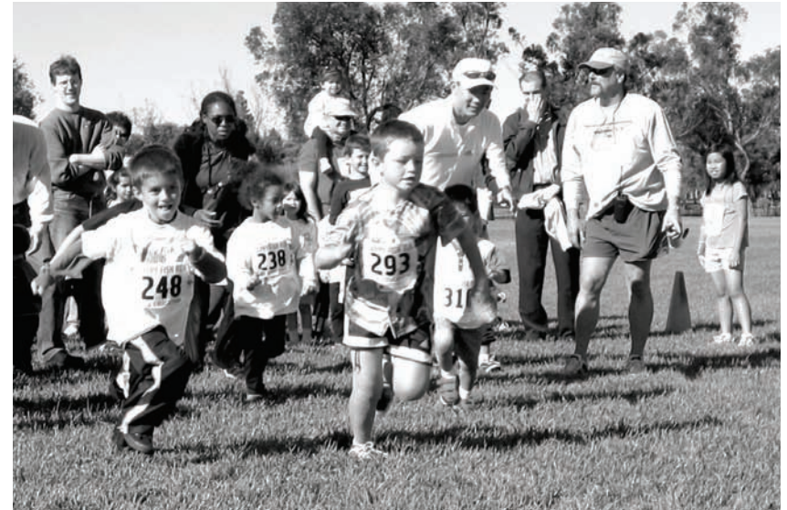
Kids, ages 4-8, take off running during the Tiny Trot at the Happy Fish Run for Education, making it the most adorable event in the history of the world.