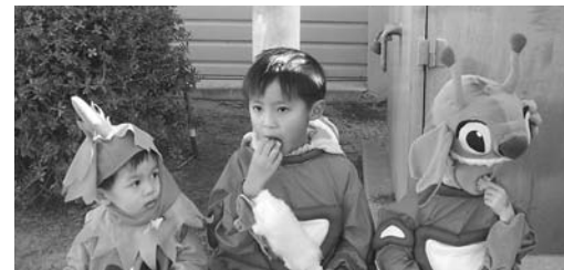
Get your costumes ready for the Happy Fish Halloween Carnival on Sat. Oct 28

The Second Annual Happy Fish Run for Education will happen on Sunday, October 15 th at 9:00 am. Participants will meet near the big playground, or the Lagoon, at Lake Elizabeth in Fremont. You can register at Happy Fish or online at www.Active.com . Registration forms can be picked up at Happy Fish and can be printed from the website www.swimhappyfish.com .