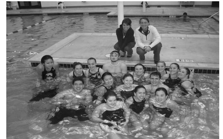
The Water Safety Instruction (WSI) graduating class of December 2004