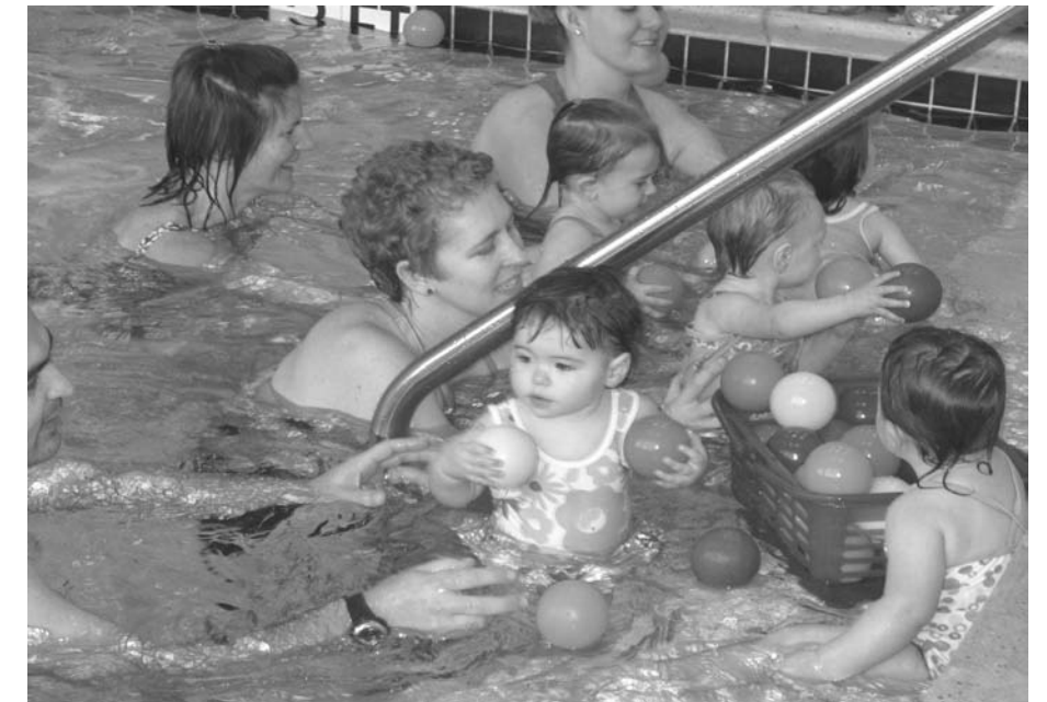
Kids have a wonderful time putting balls back in the basket during a Water Babies class